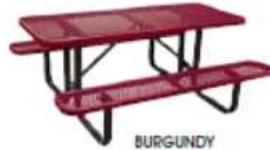
AVAILABLE IN 10 HOT COLORS!